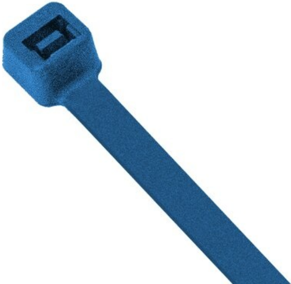
KB 4.8 x 200 HDD